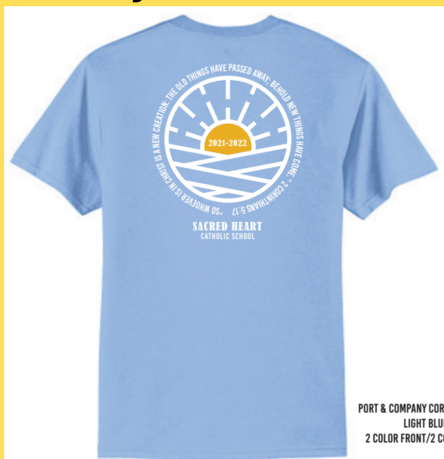
PORT & COMPANY COR LIGHT BLU 2 COLOR FRONT/2 C